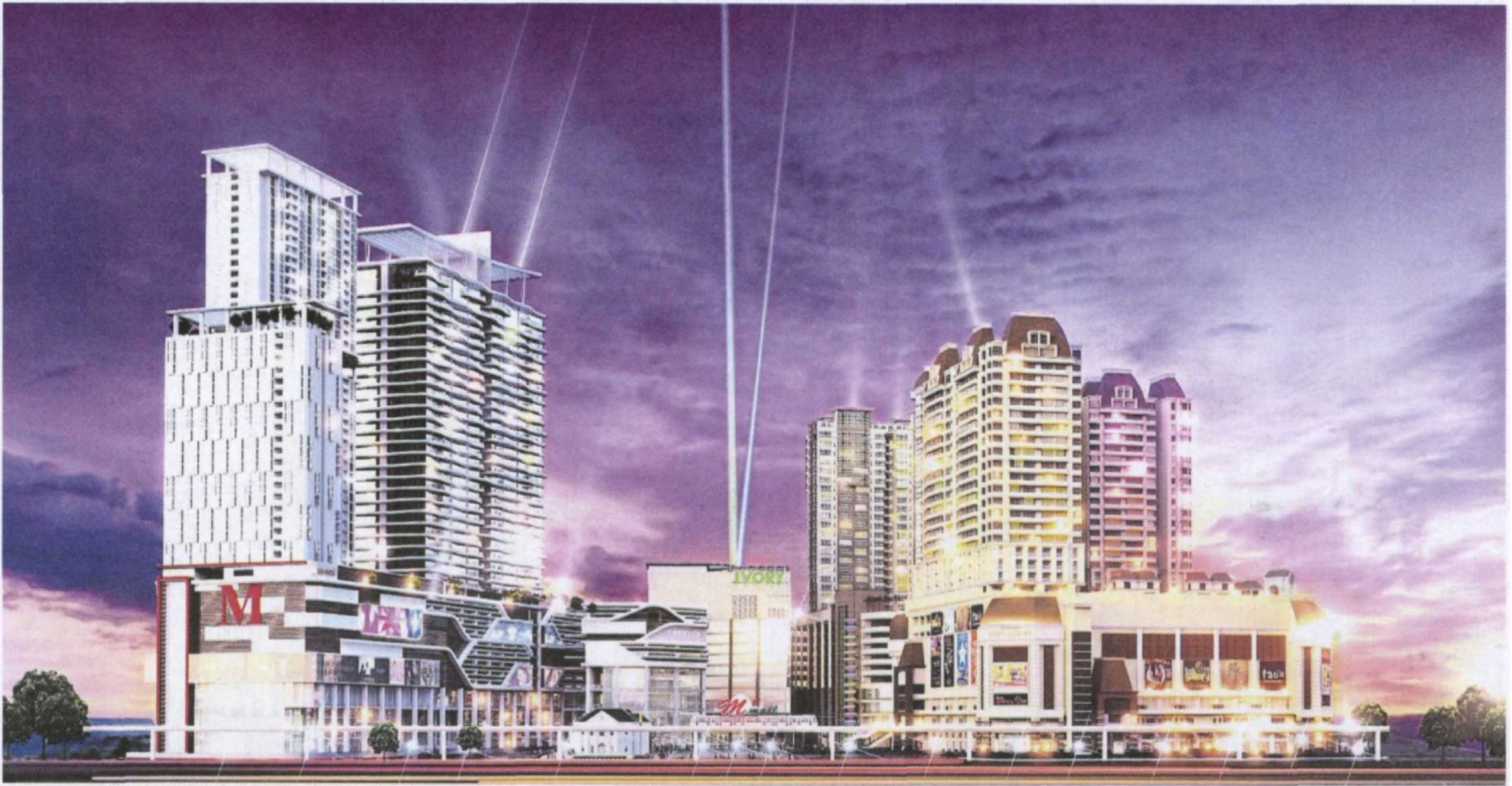
Artist's impression of the whole Penang Times Square development.