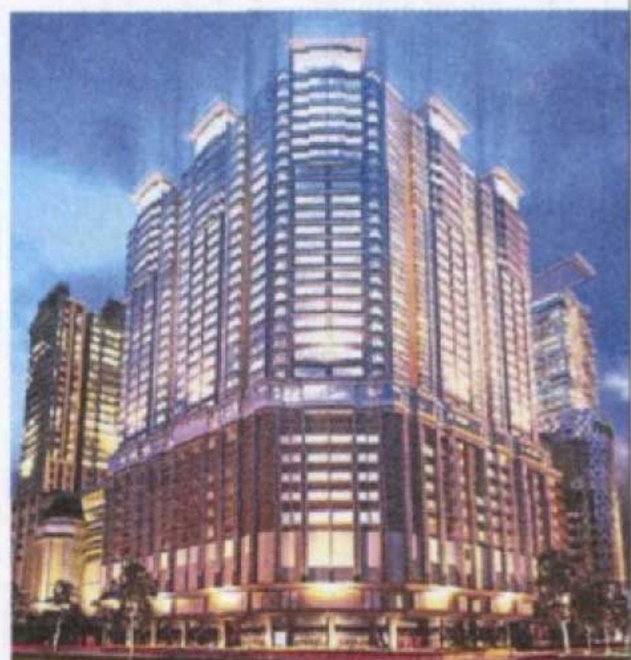
The Birch Regency is one of the component phases of the Penang Times Square property.

Penang Times Square is a one-of-a-kind development with component phases such as Birch The Plaza, Birch Regency and The Wave.